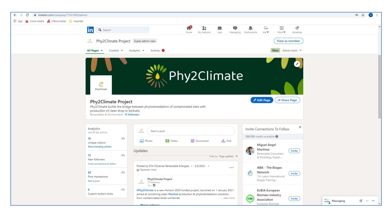
Figure 4: LinkedIn group of the project.

A LinkedIn Company page named Phy2Climate Project has been created. This page will collect news and updates about the project, and it will serve as a useful discussion platform about the project itself and the subjects related to it.