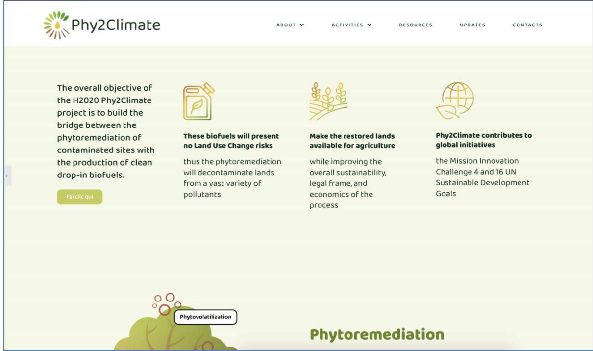
Figures 1-2: Home page of the project website.

The website is built with a Home page keeping the identity of the project in evidence (regarding the sections: Introduction, Objectives, Phytoremediation, Technology, Products, News, and Acknowledgements).